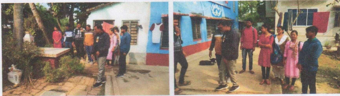
Awareness Campaign (UG & PG Students, Dept. of Bengali)